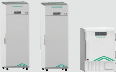
FLF120 FLF125 FLF105

FARRAR Lab Grade Freezers are the ideal solution when temperature excursions, reaching/maintaining set point temperature, and ice management are a challenge.