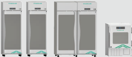
FLR120 FLR125 FLR245 FLR105

FARRAR Lab Grade Refrigerators are the ideal upright and undercounter solutions for applications that require both consistent, powerful temperature performance and energy efficiency to meet rigorous sustainability requirements.